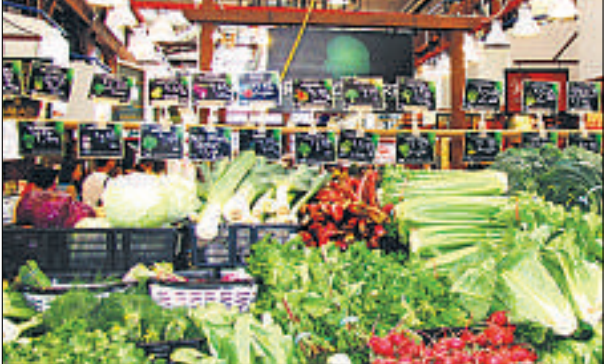
Fresh veggies at a local market

I'm wowed later by the taste of peach with fig and date bread, cheese and white wine. The last stop of the evening is the popular Irish Heather gastro pub where attractive Sean Heather is there to guide us through the sub-