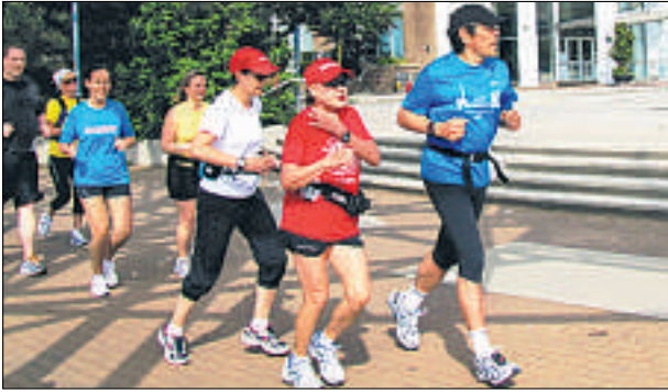
Vancouverites are fitness freaks but party well too

Although the unlikely combinations first surprise me,