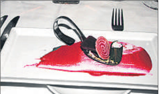
Marinated beets with ricotta and rosemary honey